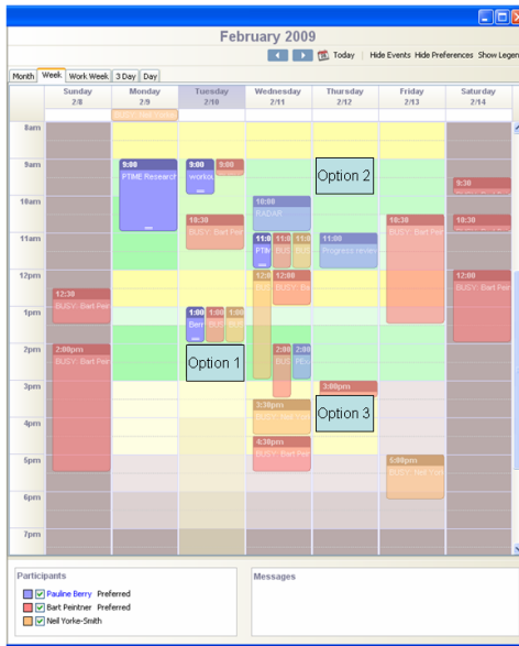
Fig. 4. Context provided by options at a glance. The three options are presented in the context of the participants’ schedules. Also, the system has information about two of the participants’ preferences and the colors encode that information. The user can delve deeper into the context to look at the meeting details and view preferences individually.